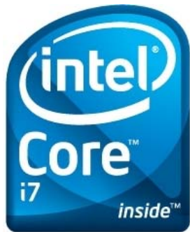
Intel® Core™ i7 processor

There's a new "king of the hill" in the world of computer processors. Intel has released the